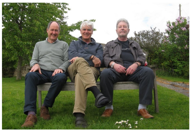
And again, 25 years later